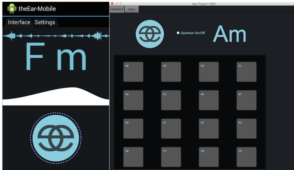
Figure 2. Left: Mobile Interface, Right: Plugin Interface

the JUCE framework 3 framework, a cross-platform C++ library especially suited for working with audio.